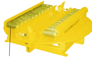
Conveyor mounted on Turntable