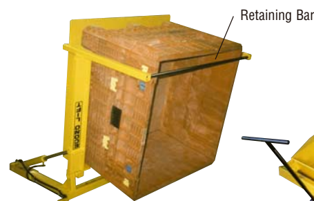
FLOOR LEVEL DUMPER