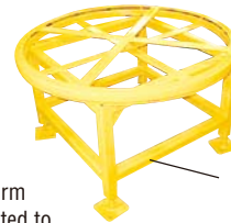
Carousel with Stand