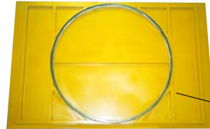
Platform Mounted to Top Ring